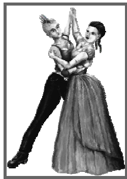
music with lyrics and a beat that changes every song...

3rd Friday of the Month: Queer Women on the Drive 7-9 pm Seniors Lounge of Britannia Community Centre. All ages, including children supervised by an adult. 604-684-5307