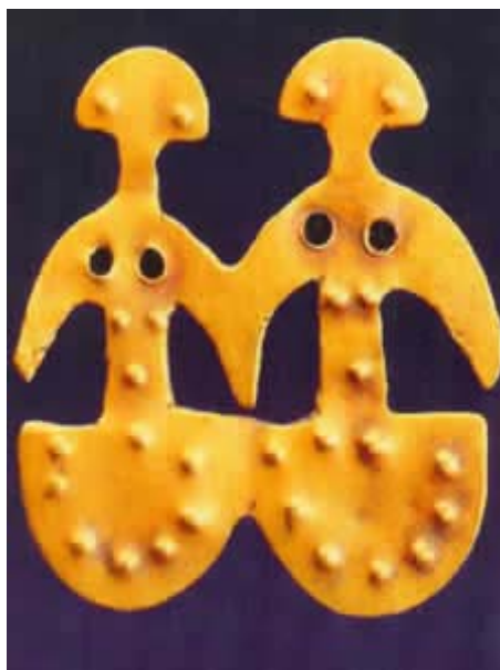
Ancient Anatolian Double Goddesses