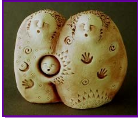
'Lesbian Family' www.amazonbookstorecoop.com